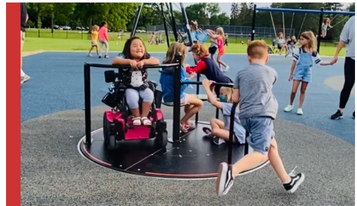
Children enjoy the ADA-accessible merry-go-round at the playground ribbon cutting.