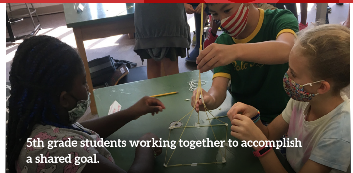
5th grade students working together to accomplish a shared goal.