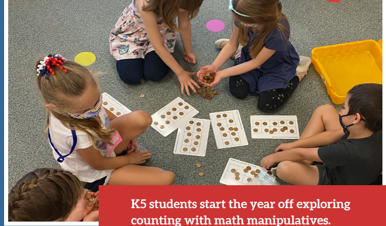
K5 students start the year off exploring counting with math manipulatives.