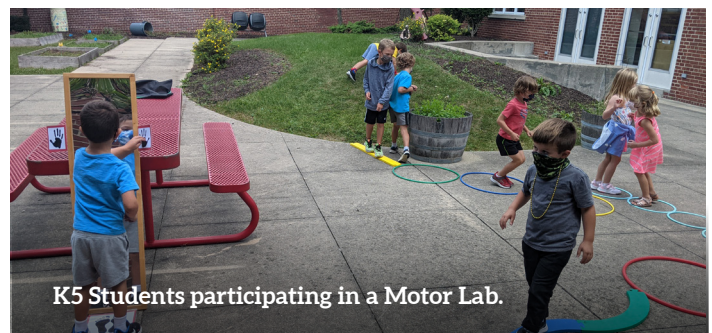
K5 Students participating in a Motor Lab.