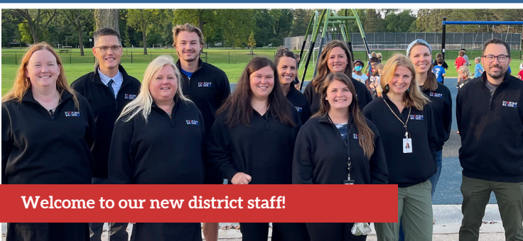
Welcome to our new district staff!