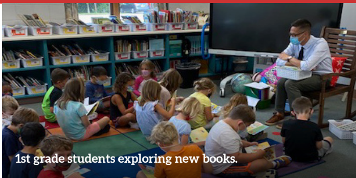
1st grade students exploring new books.