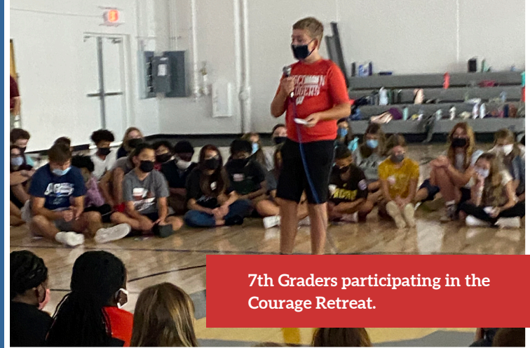
7th Graders participating in the Courage Retreat.

The 8th grade traveled to South Beach in Port Washington to kick off the new school year. The students participated in team building activities including a puzzle relay and collaborative rock/paper/scissors game. The day ended with an advisor tug-of-war competition. Thank you to the PTO for covering the bus costs.