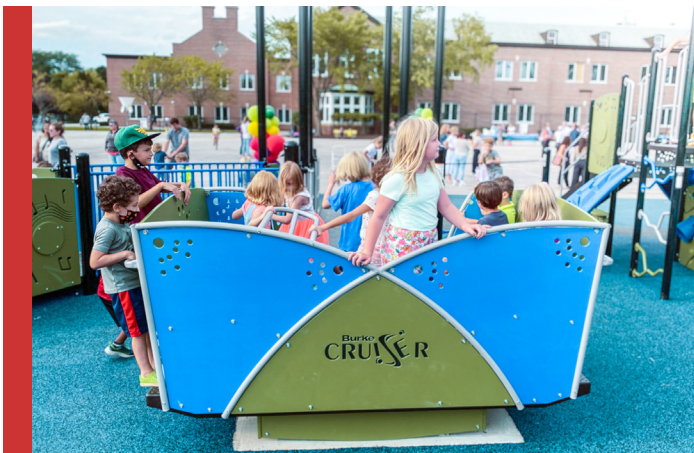
The ribbon cutting ceremony for the new playground at Stormonth Elementary was held in September 2021.

The two-year campaign to build new playgrounds at Stormonth and Bayside exceeded all expectations by raising $210,000, surpassing fundraising goals by nearly 100%. We were thankful to be able to fund more than half the cost of both ADA-accessible playgrounds, but the real success of the campaign was felt at the September 2021 ribbon cuttings where children of all abilities played together like never before in our community.