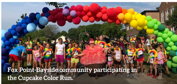
Fox Point-Bayside community participating in the Cupcake Color Run.