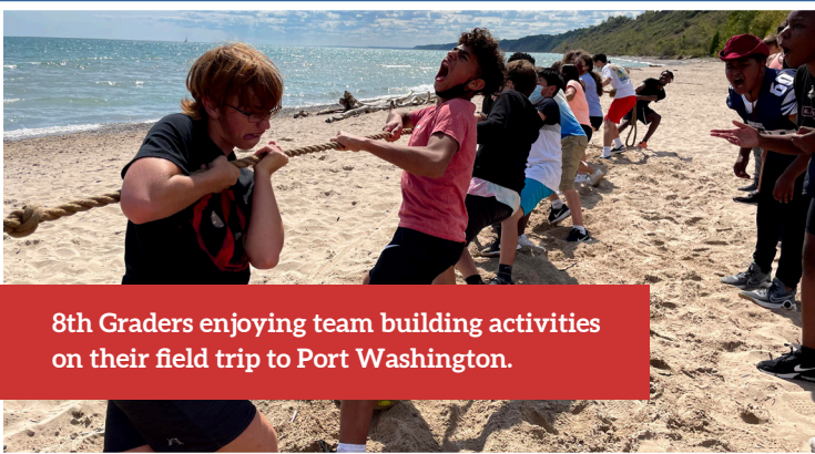
8th Graders enjoying team building activities on their field trip to Port Washington.

The hiring season is always full of opportunities to add to our high functioning team! We have clearly attracted some of the best in the field with the following new teachers and staff: